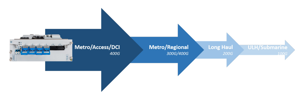
Figure 1: PM 400FRS04 - SF multi-rate, mutli-reach capability

In today's networking environment, service providers and other network operators require the ability to deliver a variety of applications and services. With a highly differentiated customer base that is demanding a broad set of services with guaranteed performance, they need a high capacity network that is capable of delivering any service to any point in the network. This means having flexibility at the transport layer that is equivalent to the services layer. EKINOPS PM 400FRS04-SF delivers an unprecedented level of configurability and manageability that allows service providers to tune their optical transport network to match their service level needs. Capable of operating in multiple different modes, it supports any type of transport application from metro access to ultralong haul including data center interconnectivity and even submarine transport.