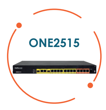
(*) Features under license