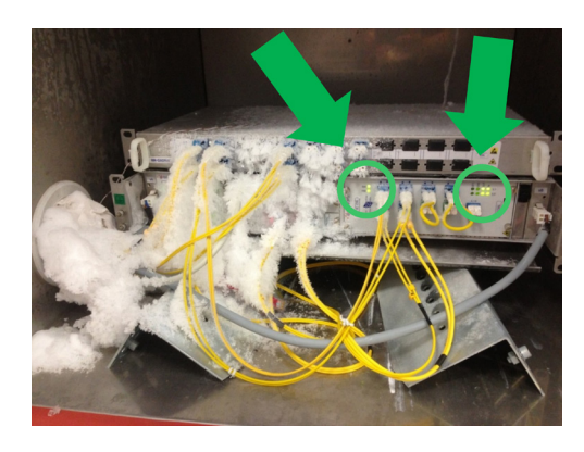
Figure 2 - Ekinops C200HC-ETR operating at -40°C (green lights indicate normal operation)

All ETR components all are designed specifically for harsh environments using hardened components with an operating temperature range of -40°C to +65°C (-40°F to +149°F). They can be located at any site lacking environmental controls including cell towers, street cabinets, remote PoPs and unmanned huts.